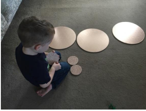
Comparing sizes for Maths