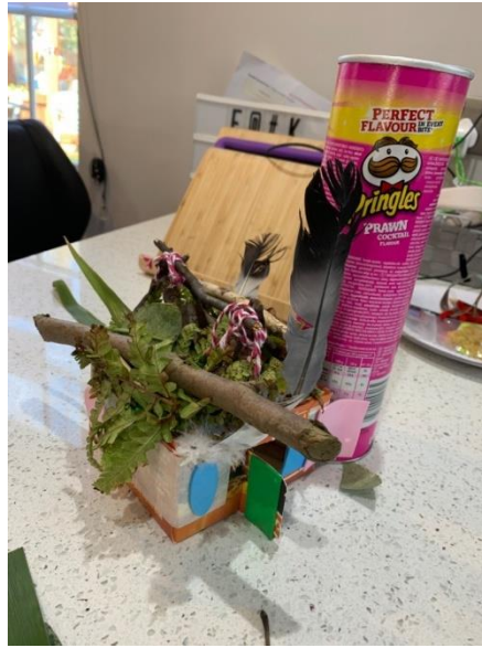
Creating a Superhero Lair.