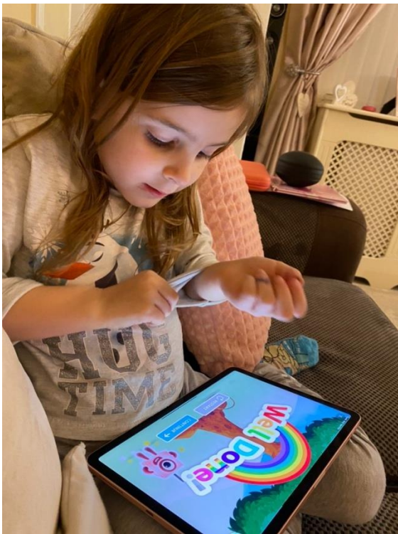
Playing a numberblocks game