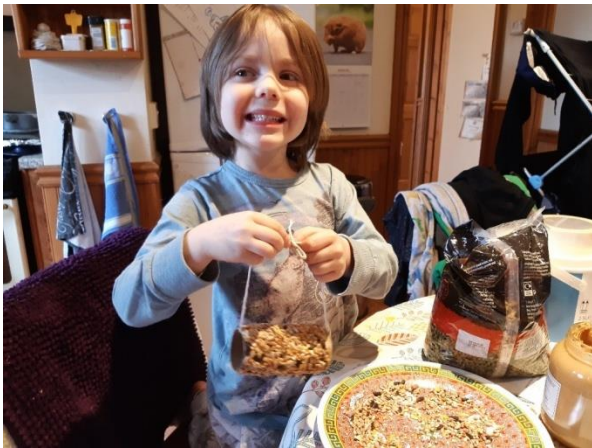
Making bird feeders