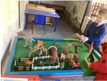
creating a dinosaur land