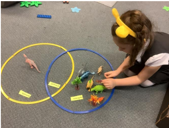
Evie sorting out our dinosaurs.

The children had some great ideas on what might have laid the egg and then what came out of it. We decided that it might have been a dinosaur and then investigated the different types, we now know about herbivores, carnivores and omnivores.