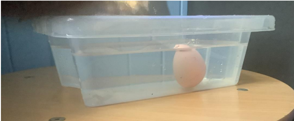
Waiting for our dinosaur egg to hatch.

We have enjoyed our Forest school sessions, where we have climbed trees, remade our dens, used natural materials to make shapes, practised our fire lighting and tried finding fossils.