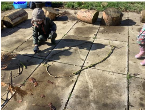
Making shapes out of natural material